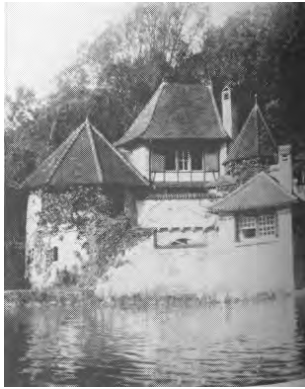
Jung's Lake Retreat at Bollingen

This four-session workshop is intended for those who want an introduction to the person of Carl Jung. Participants will go through this first hand document of Jung's life story and follow the development of thought of the greatest psychic explorer of the 20 th century.